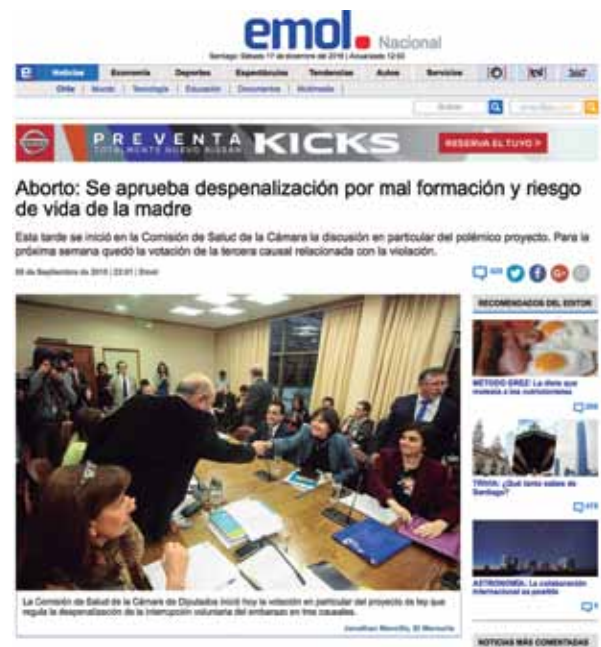
Figure 8. Image of the news extracted on September 8, 2015 from Emol.com

Ahora bien, based on the categories established by the methodology (in favor of, against and ambivalent), of the 156 comments issued by men where it was possible to recognize and determine the commentary author's point of view, 53% expressed to be in favor of one or more reasons for legalized abortion, 1% showed to be in favor of one or two reasons and against one or two reasons and 46% to be against one or more reasons for legalized abortion. On the contrary, of the 67 comments issued by women, only 27% are in favor of one or more rea-